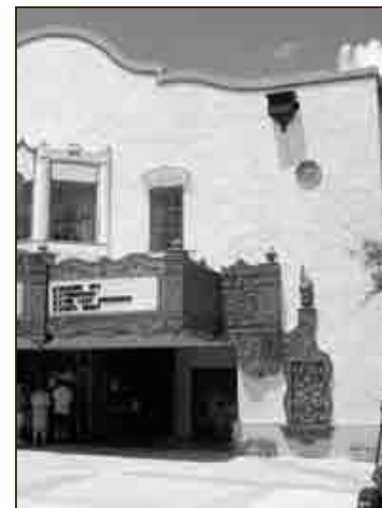
The Rialto Theatre at Spanish Springs