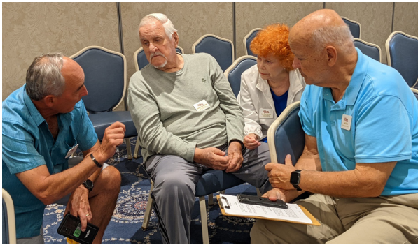
Town Hall VHA Officers Discussion